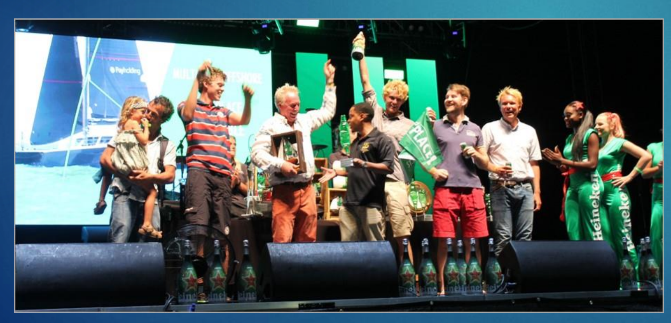
"Fastest Multihull Round St Maarten", March 2019.

Winner, Multihulls Round Barbados Race, Feb 2019.