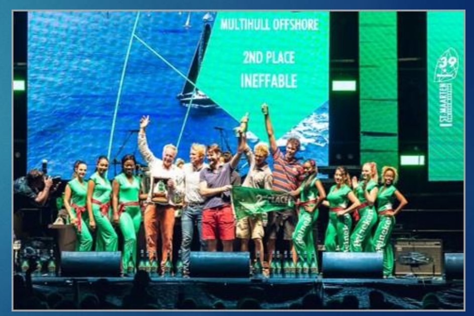
2nd Overall. Heineken Cup St Maarten, March 2019.